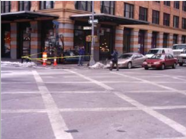
On site Groundwater treatment in New York City

At one site in New York City, Ground water below a building at a busy intersection showed free product. It was not possible to remove the free product by other available products/technology. After discussions with NY DEC, it was decided to inject HydroRemed directly in the ground water. Five injection wells were installed for injection of ground water as seen below.